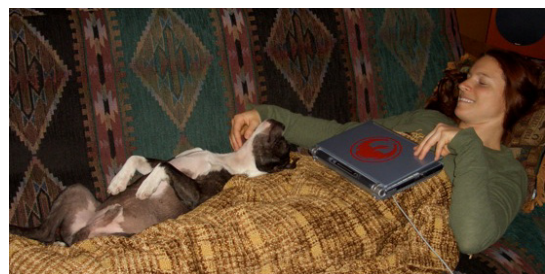
Lounging with my first foster, Dozer

So my mom and I hopped in the car and drove about twenty minutes to go get “Dozer,” a Boston Terrier. Dozer was a wreck-broken tail, crooked spine, damaged eye, ear infection, kennel cough-you name it, he had it. He was my first dog ever and I was already administering meds! The good news was that he was potty trained and he loved all living things, and after a week of farts (him) and giggles (us), he found the perfect forever home with a family whose children had saved up all of their allowance money to adopt him. That's right about where my addiction to fostering begun.