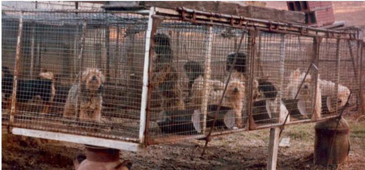
A typical puppy mill ii

The term “puppy mill” is commonly used to describe large, commercial dog breeding facilities with subpar standards of care. After a drought following WWI, farmers were in need of a cash “crop,” so they stuck dogs into their chicken coops and rabbit hutches and began breeding them for money. The deplorable conditions in which the dogs lived was the impetus for the Animal Welfare Act (discussed below). i