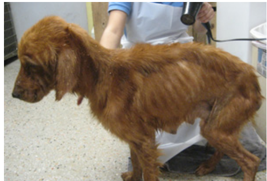
Gracie, saved by Golden Rescue South Florida

Thousands of puppy mills exist throughout United States, with the largest concentrations of mills in MO, NE, KS, IA, AR, OK, and PA (many puppy mills are run by Amish). iii Millers (puppy mill breeders) try to fool people into believing they are reputable breeders by saying things like, "We have a USDA license." I'm not impressed, and you shouldn't be either. It can be argued that holding a USDA license is