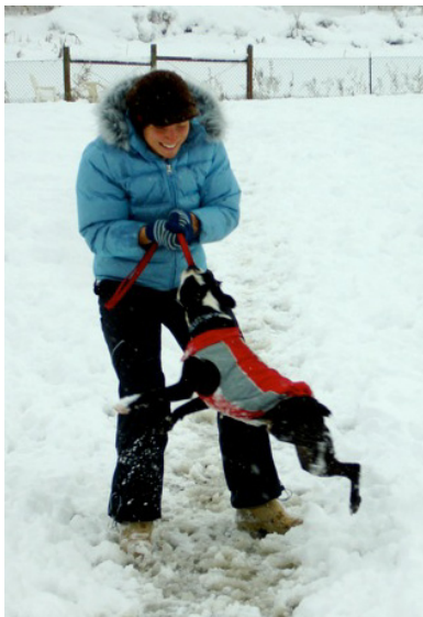
Bill is a whole new dog today

Each day we carried Bill outside several times to get him to go potty, but for the rest of the time he would just sit in his bed. I started thinking I should just re-home him with an elderly someone who had little activity in their home. But then I hired a trainer and life changed irreversibly for both Bill and me.