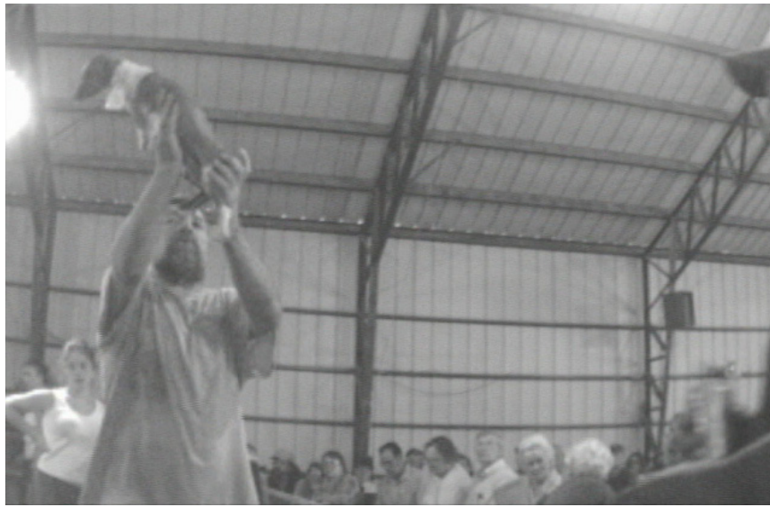
Puppy mill auction vi

To illustrate the point, here is one rescuer’s memory of attending an auction: