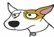
Brow Furrowed, Ears to Side