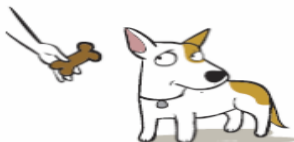
Suddenly Won't Eat but was hungry earlier